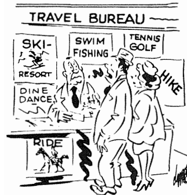
"Is there someplace to take our vacation and just do nothing?"

WHELAGRAM AND MISHAWAKA PLANT TAKE A HOLIDAY ... During the weeks of July 16 and 23 the plant will be closed for summer vacation shut-down. BE SURE to check your distribution rack Friday, August 4, for your next issue of Wheelagram .